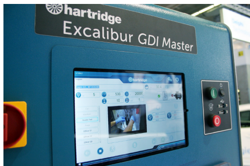
In-screen video prompts