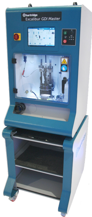
Excalibur GDi Master & Workshop Trolley